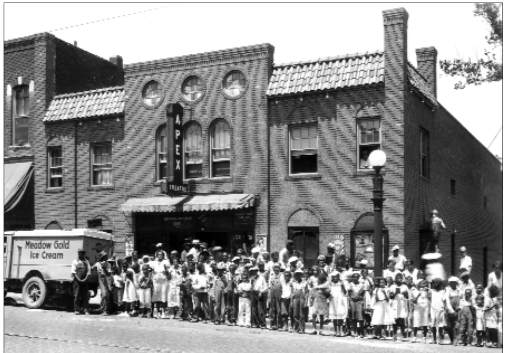
Topeka's black commercial district comprised various businesses including the Apex Theatre, photographed here with what appears to be a crowd of patrons in 1933.

African Americans could not use all of the city recreational facilities, but a good swimming pool and athletic fields were available to them in Central Park. As the plain-