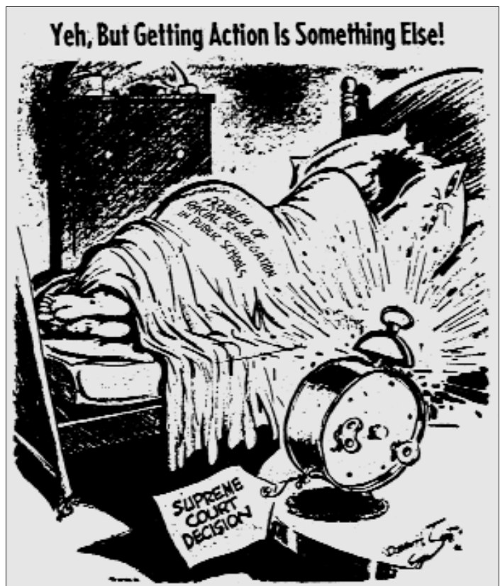
Although both daily newspapers and most Kansans supported the Brown decision, a political cartoon in the May 29, 1954, issue of the Topeka Daily Capital implied that “getting action” on the ruling would be the next challenge.